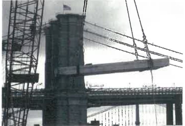
Cut sections were rigged and removed from the work area by crane.

Cutting of the concrete pier deck began eight days later, on June 13, with two Husqvarna 8400 flat saws. Operators made a series of latitudinal and longitudinal cuts to divide the slab into pieces that could be lifted out and removed by crane. Atlantic Concrete Cutting operators made 21,850 linear feet of cuts on the pier deck, some as deep as 18 inches. Upon completion, Trevcon Construction rigged and removed the cut deck sections by crane and exposed the pier caps and piles for the contractor's next task.