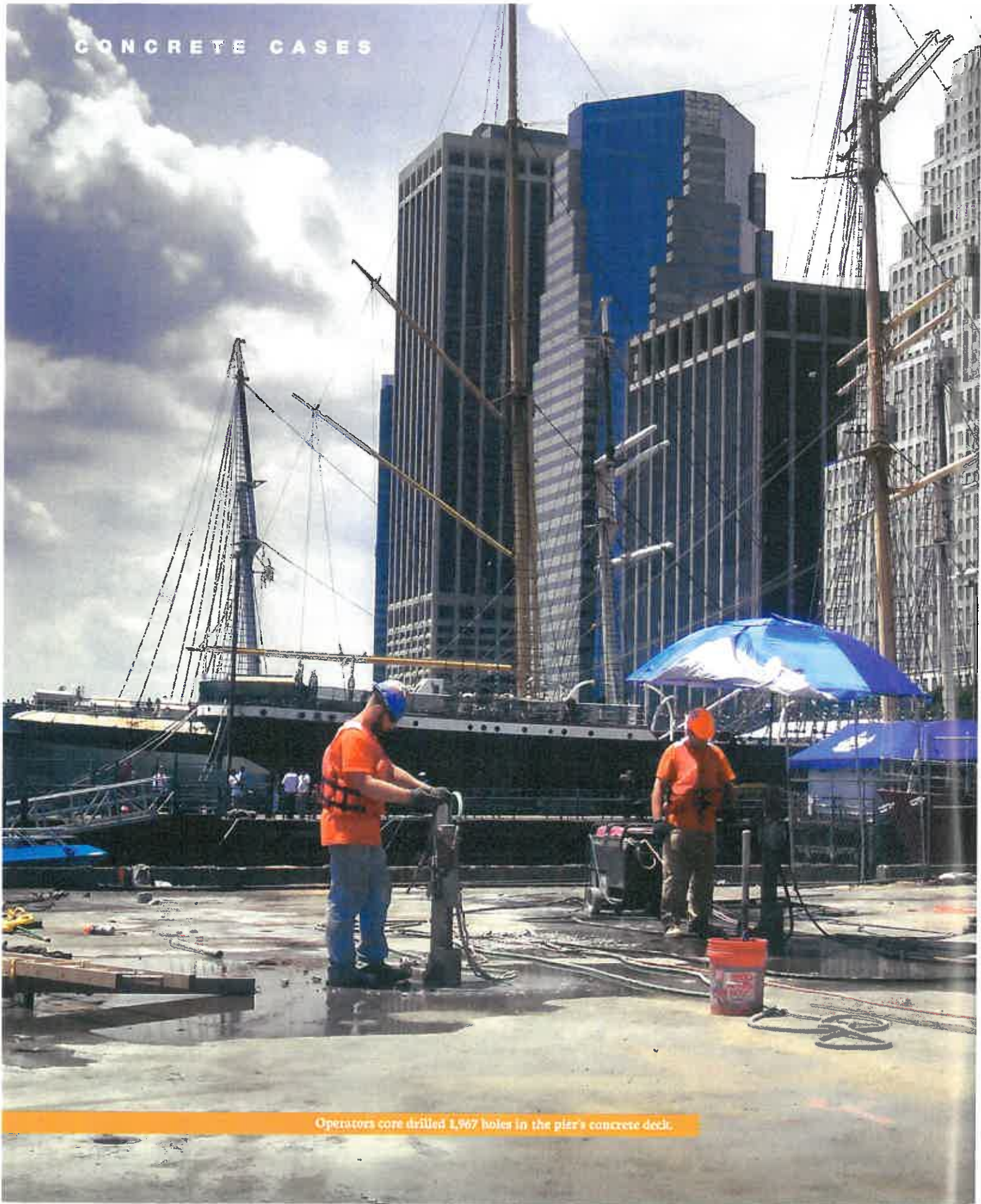
Operators core drilled 1,967 holes in the pier's concrete deck.