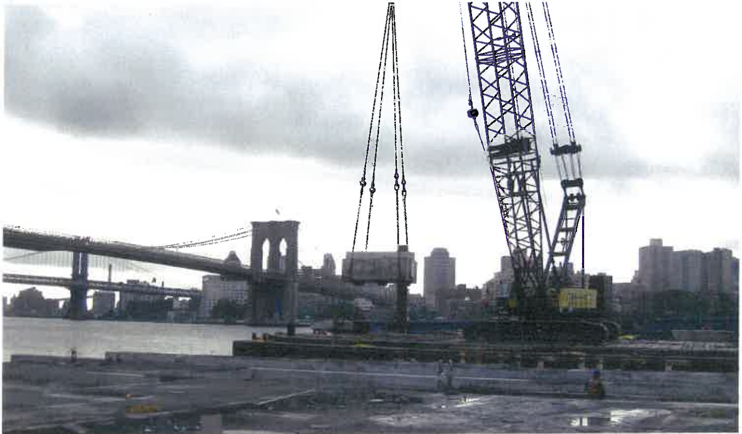
Some sections weighed over 45,000 pounds.

The pier had a series of caps that had to be removed before 610 piles measuring 14 inches by 14 inches could be cut to elevation. Two Hilti DSW 3018-E wire saws were set up in the work area to make the necessary cuts using 1,200 feet of diamond wire, starting with the pier caps. Over 10 weeks, operators performed 429 pull cuts with the wire saws through 4-foot by 3-foot cross-sections of the pier caps, with each wire saw cut taking approximately 45 minutes to complete. The 14-inch by 14-inch pile cuts then took a further 10 minutes to complete and were cut in clusters of six or nine, so all the pier caps and piles were cut within 10 weeks. Atlantic Concrete Cutting then had an additional 1,000 square feet of wire sawing work to cut various supports left after demolition of the old pier building. Some back wall cuts were also made to separate the pier from the Fulton Street Fish Market, a historic building that was to remain in place. All work was completed on September 11—one month ahead of schedule.