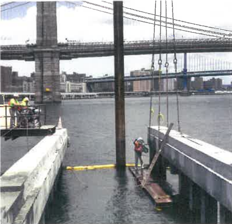
The contractor made 21,850 linear feet of cut lines in the pier deck.