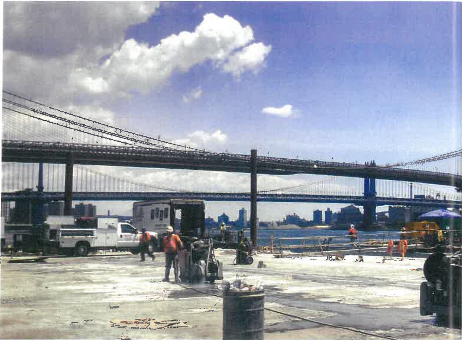
The pier deck was cut into sections using flat saws, some cuts being as deep as 18 inches.