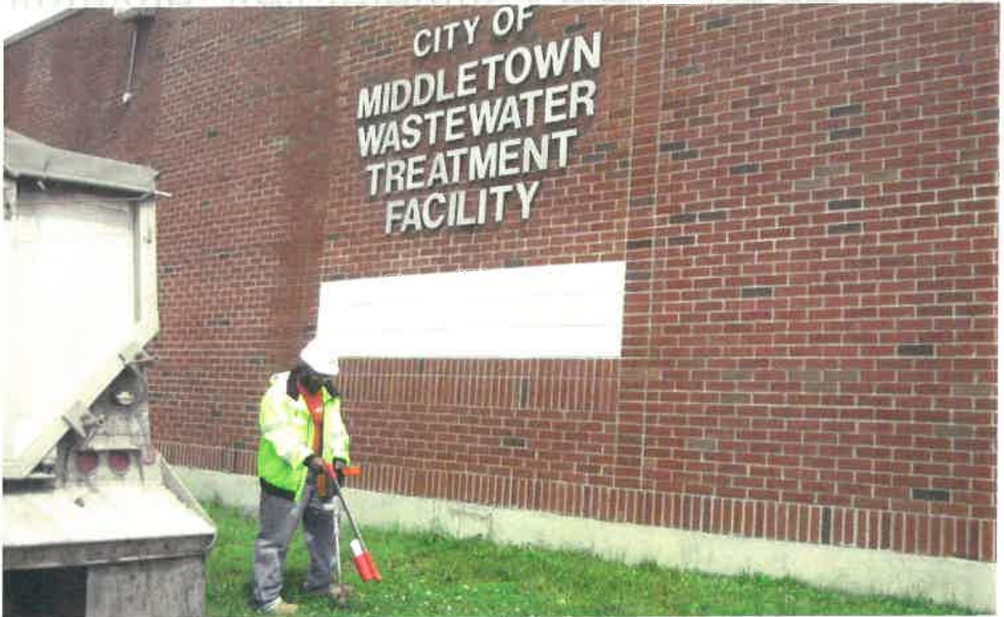
The results have helped engineers with the design of a new sewer system.

to locate. This was especially problematic in areas of wet soil. In these situations, the team slid a metallic snake line through an area of clean-out and traced the line using a radio-detecting RD4000 utility locator.