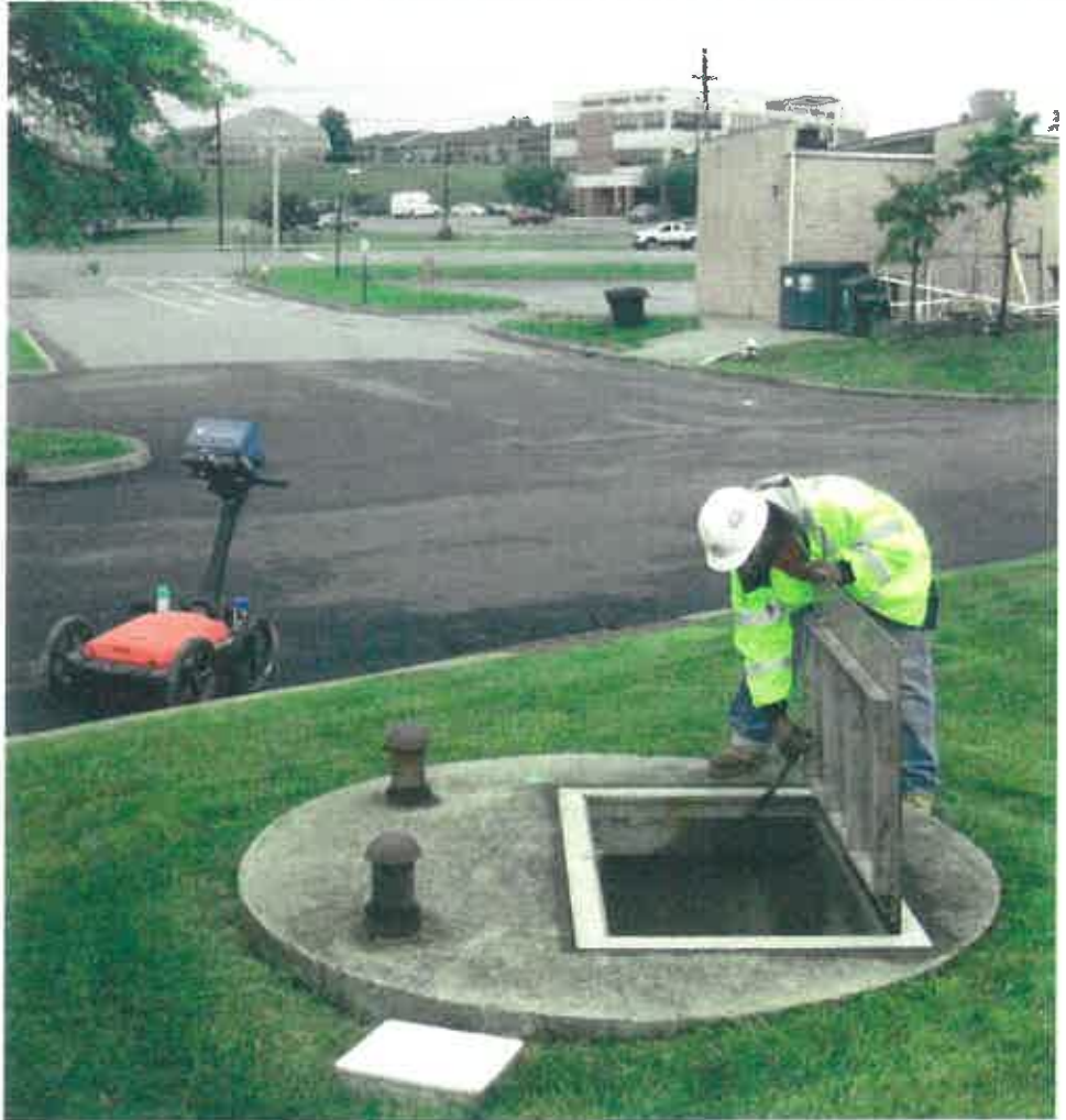
The equipment was used to cover an average of 460 feet per hour.

The locating of utilities started at a proposed sewer pump station approximately 2,000 feet west of an intersection at Route 6 and Route 17M. From there, the proposed route took the team north and led them to the grounds of the City of Middletown Wastewater Treatment Facility. The route was planned so that work began at the location of the proposed sewer pump station. This was because this area had the least amount of traffic and buildings. There were 11 manholes along the route, which the contractor accessed to confirm some utility runs. It was specified that ASI would locate and mark out underground utilities from curb to curb and 15 feet beyond each side, all within the New York Department of Transportation’s