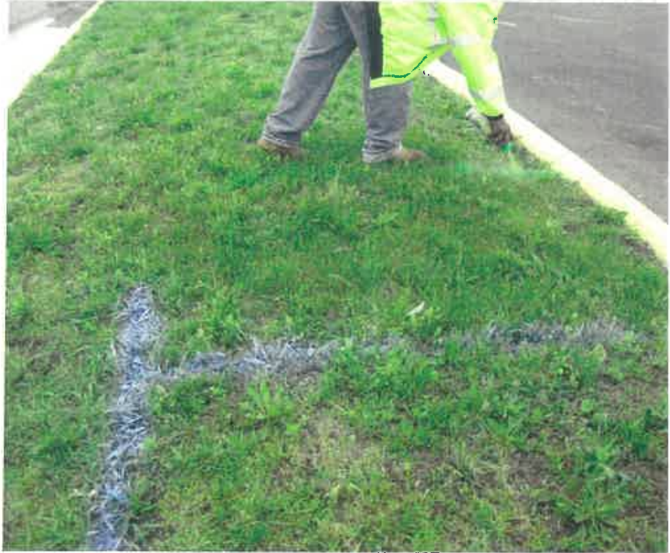
All electrical, gas, telephone, sewer and water lines were identified with APWA uniform color codes.

Another challenge encountered by the team from ASI, was locating sewer services through different materials. Small plastic piping for these services was buried beneath different types of soils, concrete and asphalt, making it sometimes difficult